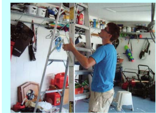
TCHS Service Learning Academy student