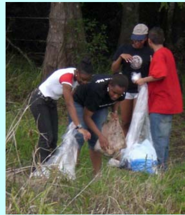
TCHS Service-Learning Academy students–Nature Preserve Clean-up