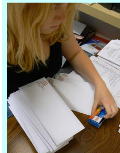
TCHS Service-Learning Academy student