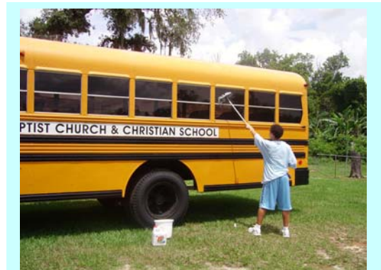
TCHS Service-Learning Academy student