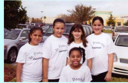
TCHS Service-Learning Academy—Summer Dancing Class/Mentoring