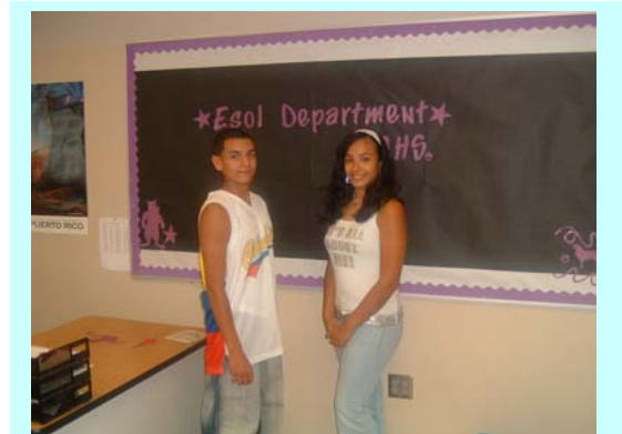
TCHS Service-Learning Academy Students–ESOL