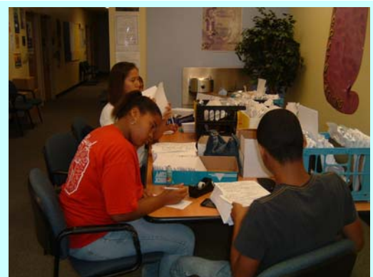
Service-Learning Academy Students