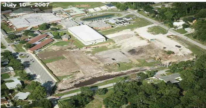
July 10, 2007

The block of North Palmetto Street in Bunnell looks very different than it did a year ago. It's now the home of the new Bunnell Elementary School. Teachers and students can't wait to begin their move into this beautiful building which includes an administration area, media center, cafeteria, stage, art room, music room, enclosed play area, 17 classrooms, 4 resource rooms, and 2 computer labs! The original school building is undergoing renovations to become a preschool center of excellence and child care center. Mark your calendars for September 6th to join in celebrating the opening of the new school and honoring the 85 years of service Bunnell Elementary School has provided to the community.