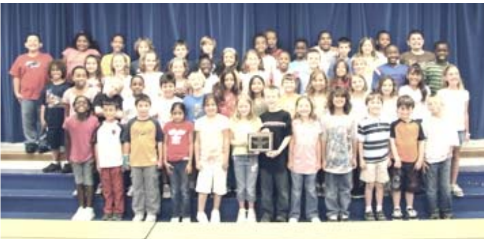
Pictured above, students receive “Environmentalist of the Year” award. Pictured right are students teaching guests about the Right Whale and the many species of plant life in the park.