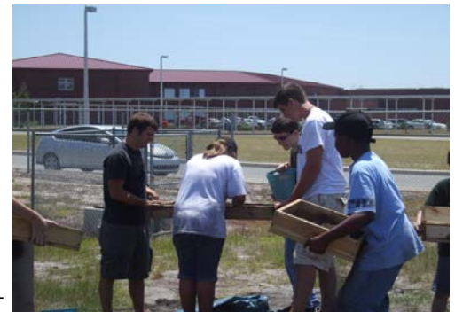
Community Problem Solvers of FPCHS and MHS were valuable partners in the Dig-It! project throughout the year.

This year’s academic accomplishments were further highlighted when the three classes were named “Environmentalist of the Year” by the Flagler Beach Environmental Preservation Council in May. Service learning has given these 2 nd grade students lifelong lessons about preserving and protecting their environment while mastering Sunshine State Standards! Does it get any better than that?