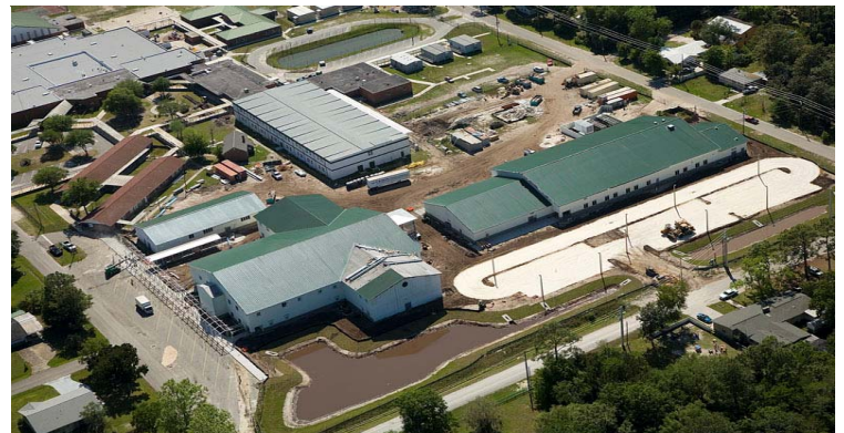
April 11, 2008